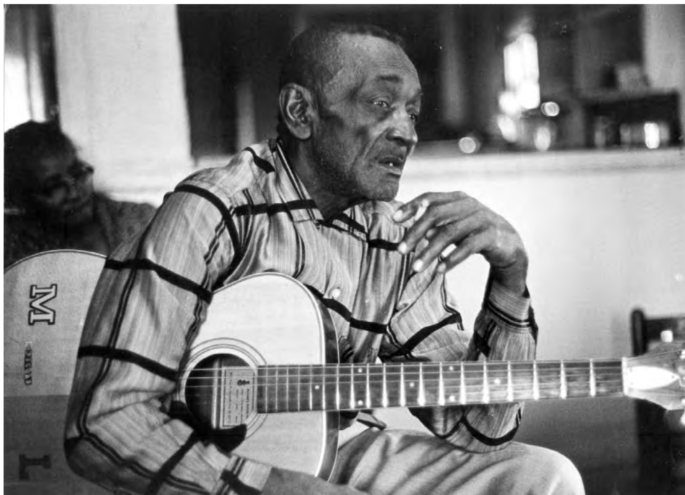
Mance Lipscomb, 1967.